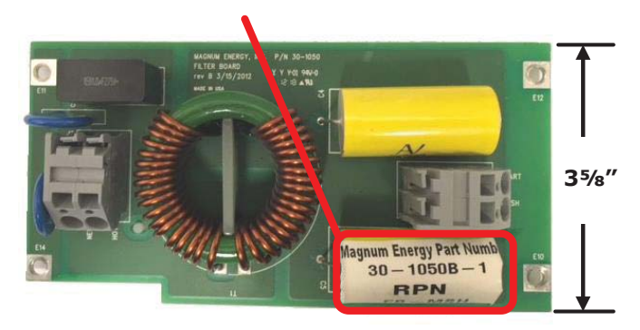
Figure 1, Filter Board (MSH models)