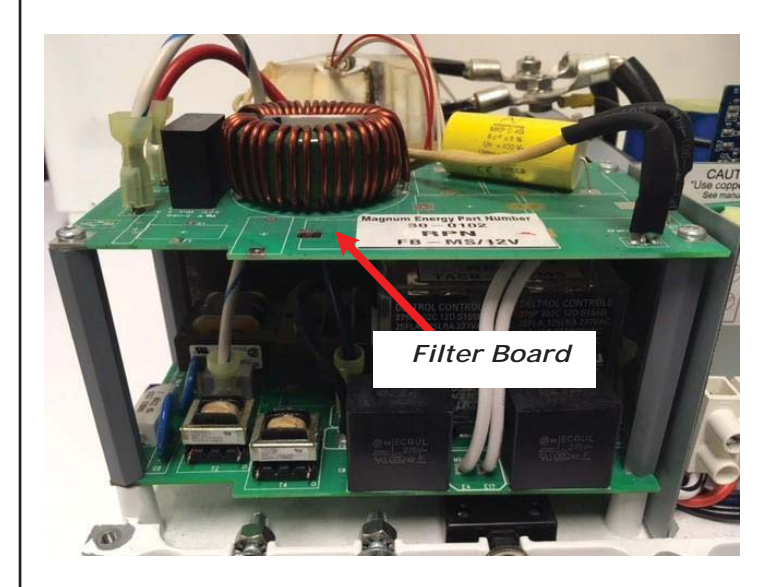
Figure 2, Locating the Filter Board