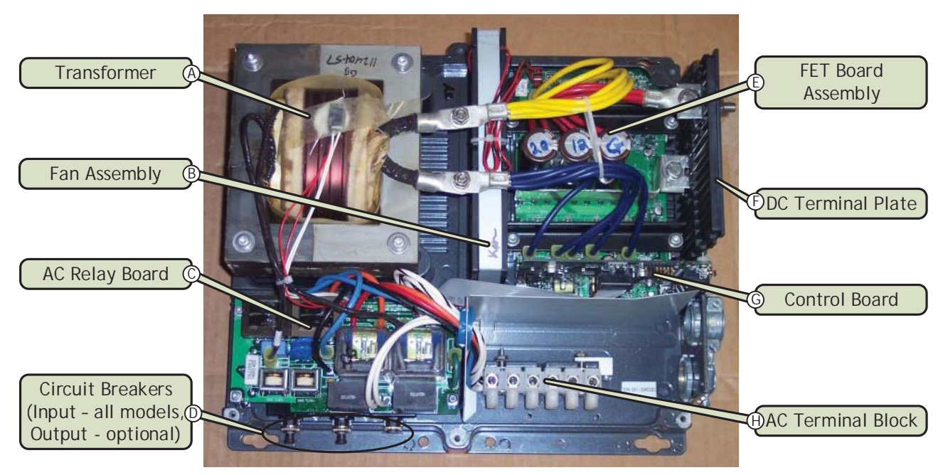
Figure 2, ME or RD Series Inverters – Internal Components

Note: The illustrations below may not exactly match the inverter, and may include options not included on the inverter being serviced.