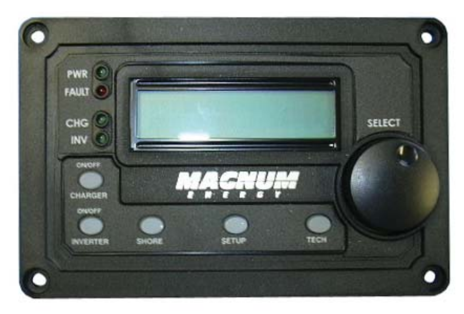
Figure 1, ME-RB Remote Control

Info: For information on installing, operating and troubleshooting the ME-RB, refer to these sections in the ME-RC Owner's Manual.