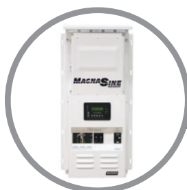
MMP Panel For one inverter only

MMP and MP Panel Systems, using the MS-PAE inverter/charger, work to power small and large homes.