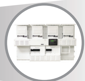
MPDH Panel For 2-4 inverter systems