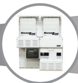
MPSL Panel For 1-2 inverter systems