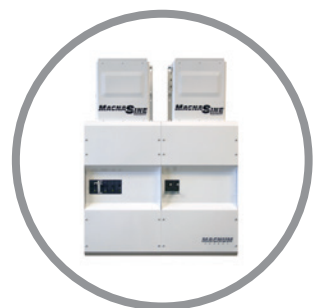
MPDH Panel as shipped