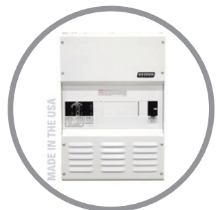
MPSL Panel as shipped