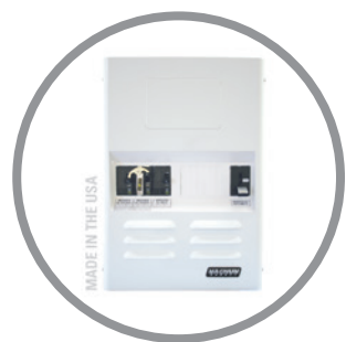
MMP Panel as shipped